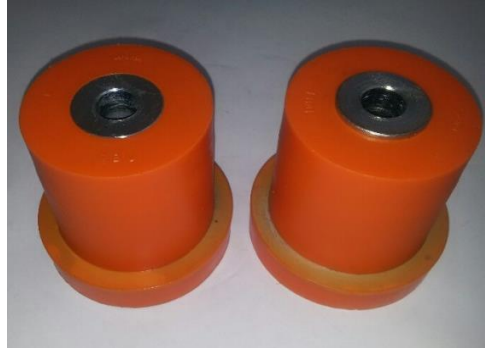
2x 1BG Polyurethane Pieces and 2x 1BG Tubes

The bush should be fitted on the wishbone such as the flange faces the front of the car.